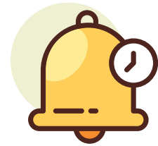
Automatic notifications and reminders to patients