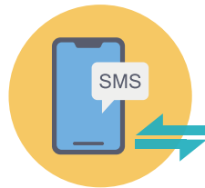
2-way messaging system